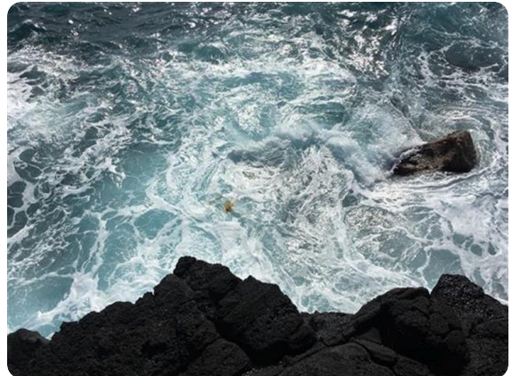
ALOHA NUI LOA